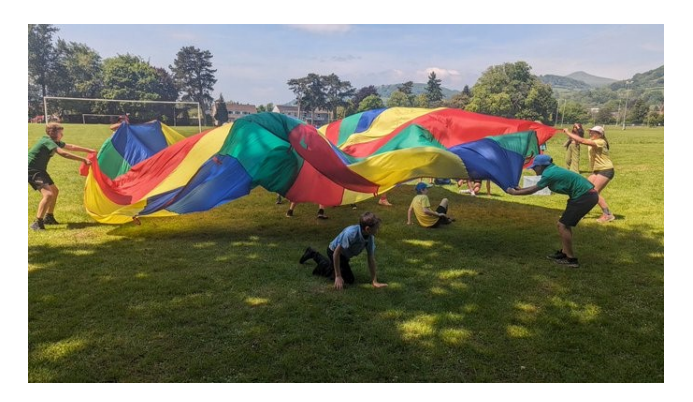
Blwyddyn Pump had a fantastic day at Bailey Park with <u>@MonLifeOfficial</u>